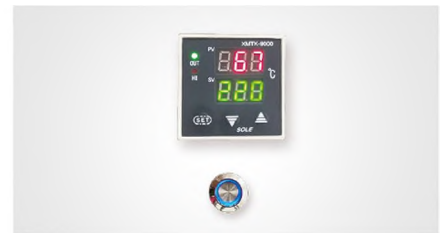
Centralized temperature controller with On/Off button