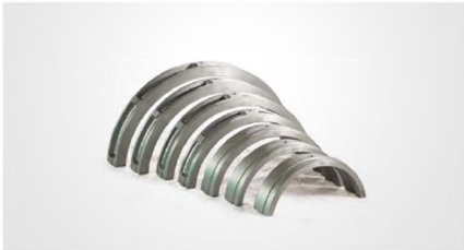
Aluminum reducing inserts