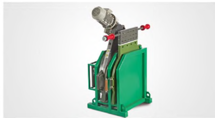
Unique Teflon coated heating plate in support bracket