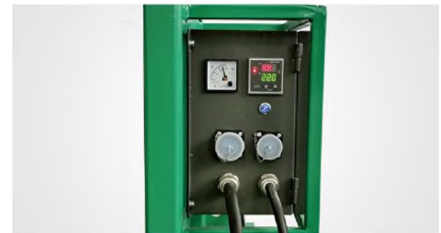
All connection sockets at the back of electrical cabinet