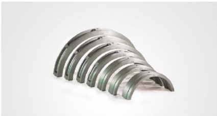
Aluminum reducing inserts