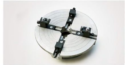
Aluminum stub end device