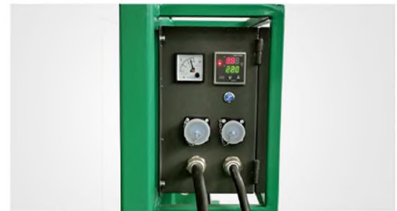
All connection sockets at the back of electrical cabinet