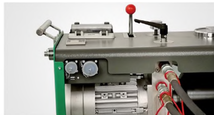
All connection sockets at the back of unit USB charging port ready for phone and pad