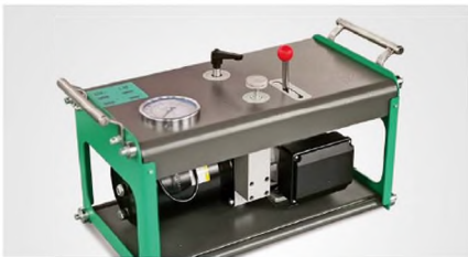
Hydraulic unit with detachable frame

All machine components are covered by MM-TECH warranty