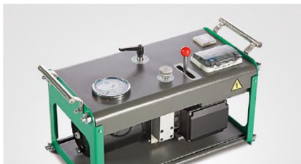
Hydraulic unit with detachable frame

All machine components are covered by MM-TECH warranty