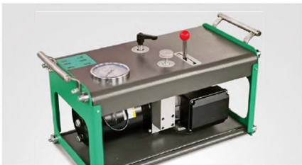
Hydraulic unit with detachable frame

All machine components are covered by MM-TECH warranty