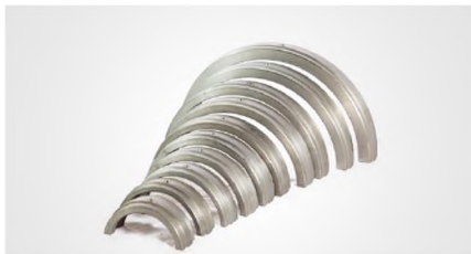
Aluminum reducing inserts