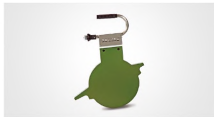
Unique Teflon coated heating plate